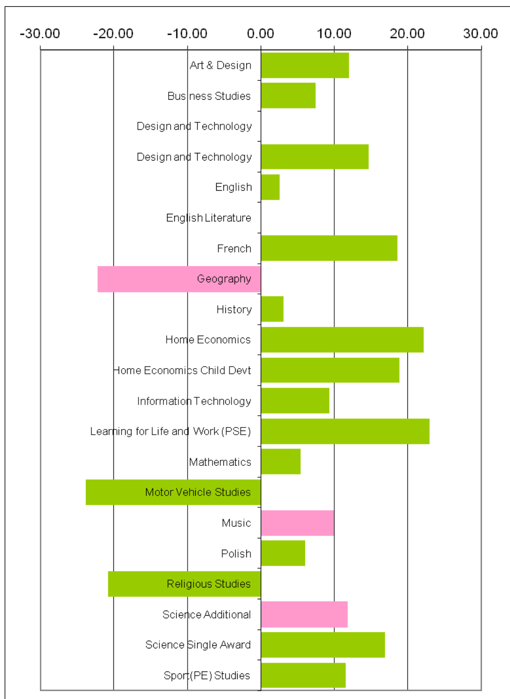
TABLE 2 shows the 3 year average performance of each individual subject at GCSE Grades A*-C , compared with the corresponding Northern Ireland average.