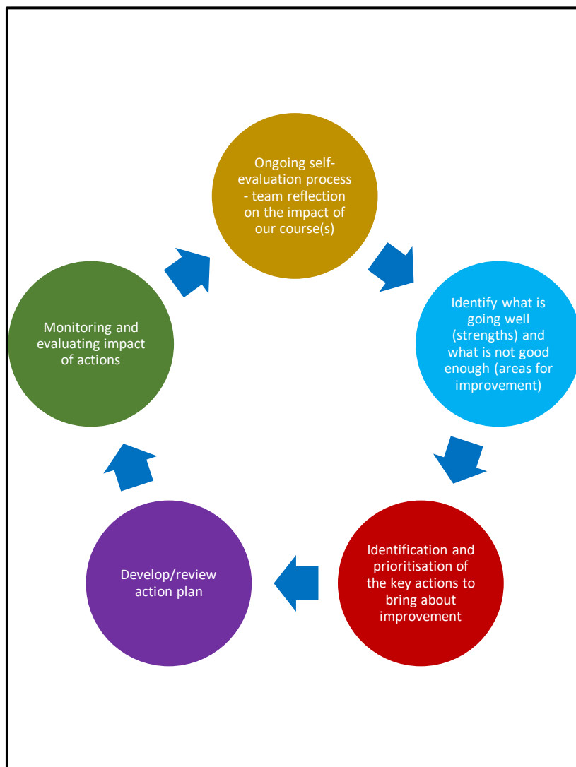
Diagram 1: The quality improvement planning cycle